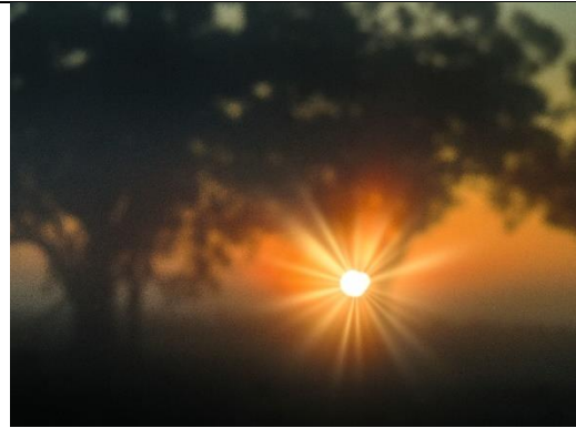
EDPI A Foggy Sunrise Lynne Cook