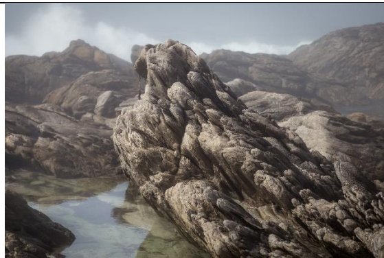
EDPI Rocky Outcrop Rhonda Buitenhuis