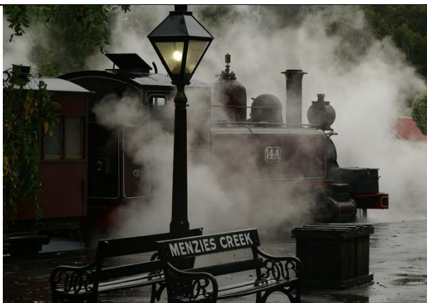
EDPI Puffing Away Brian Cahill