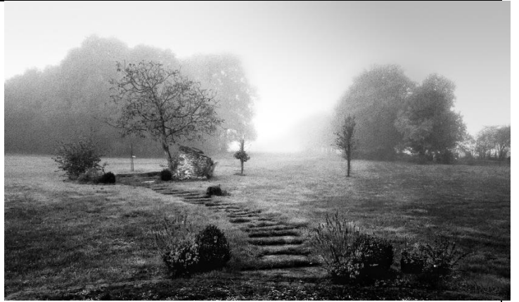
Vista Renee Sterling