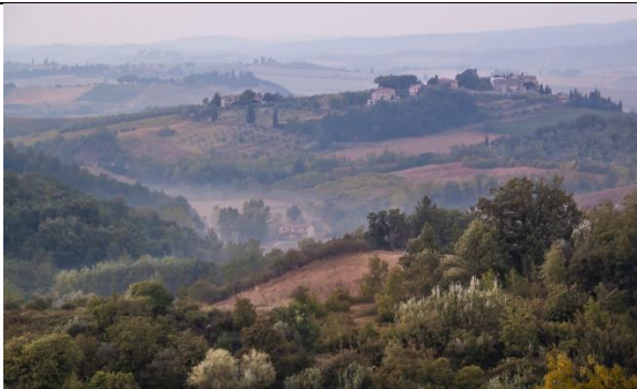
EDPI Tuscan Hillside Rhonda Buitenhuis