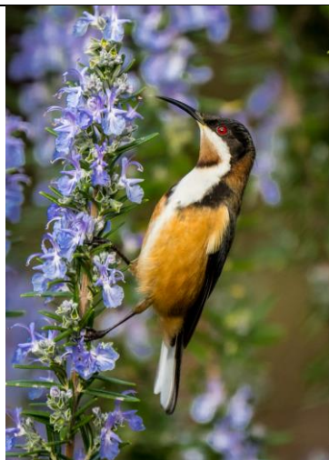
Highly Commended Print Eastern Spinebill Jenny Skewes