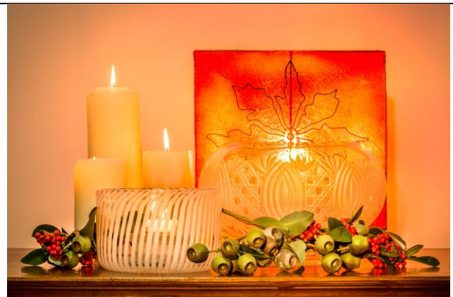
Commended EDPI Orange Glow Rhonda Buitenhuis