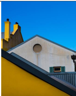
Highly Commended EDPI Blue and Gold Renee Sterling