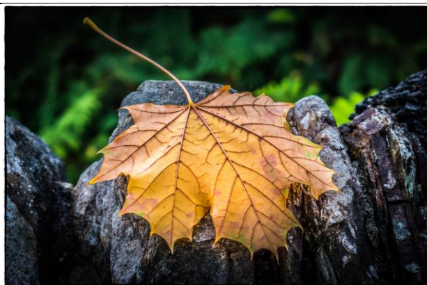
Highly Commended EDPI Draped Lynne Cook