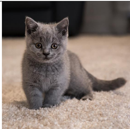
Commended EDPI The New Kitten Rhonda Buitenhuis