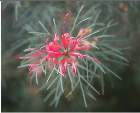
Highly Commended EDPI Floral Impressionism Kathryn Shadbolt