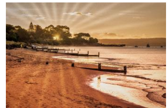
The Groins by Lynne Cook