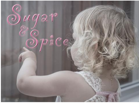
Best Print Portfolio & Highly Commended Sugar & Spice Rhonda Buitenhuis