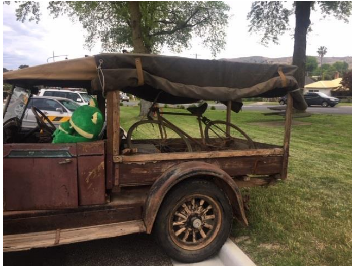
From the recent Great Victorian Bike Ride