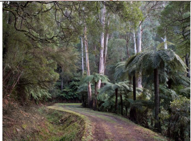
Best EDPI Portfolio & Highly Commended The Aqueduct Track Jenny Skewes