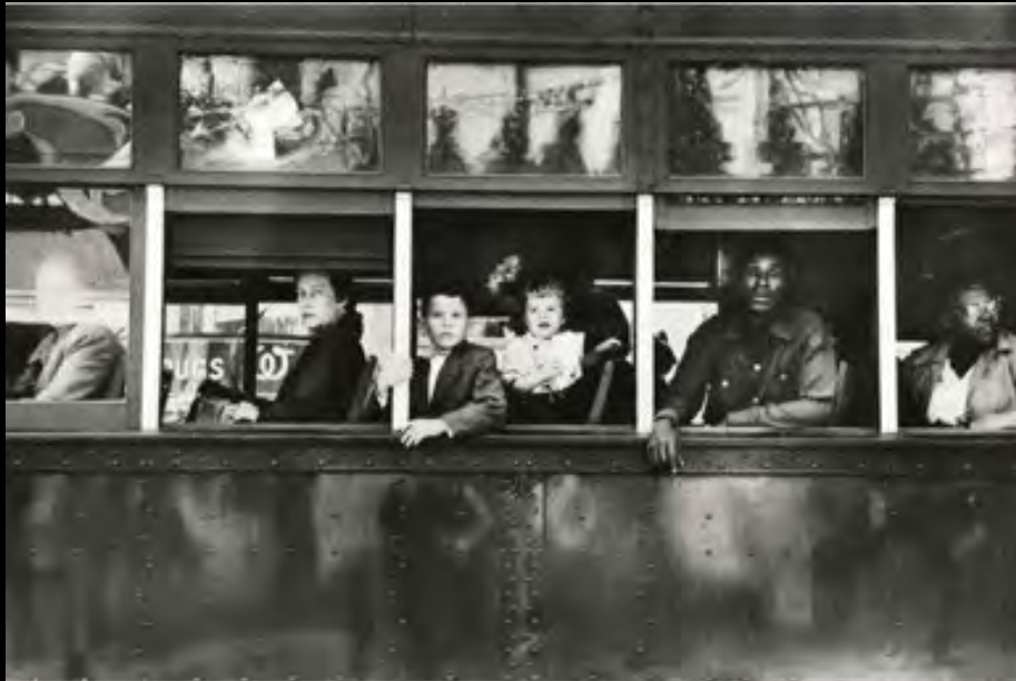
Trolley New Orleans 1955 “The Americans” Robert Frank