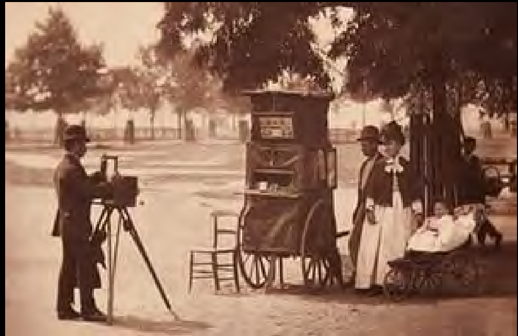
A street photographer at work on Clapham Common