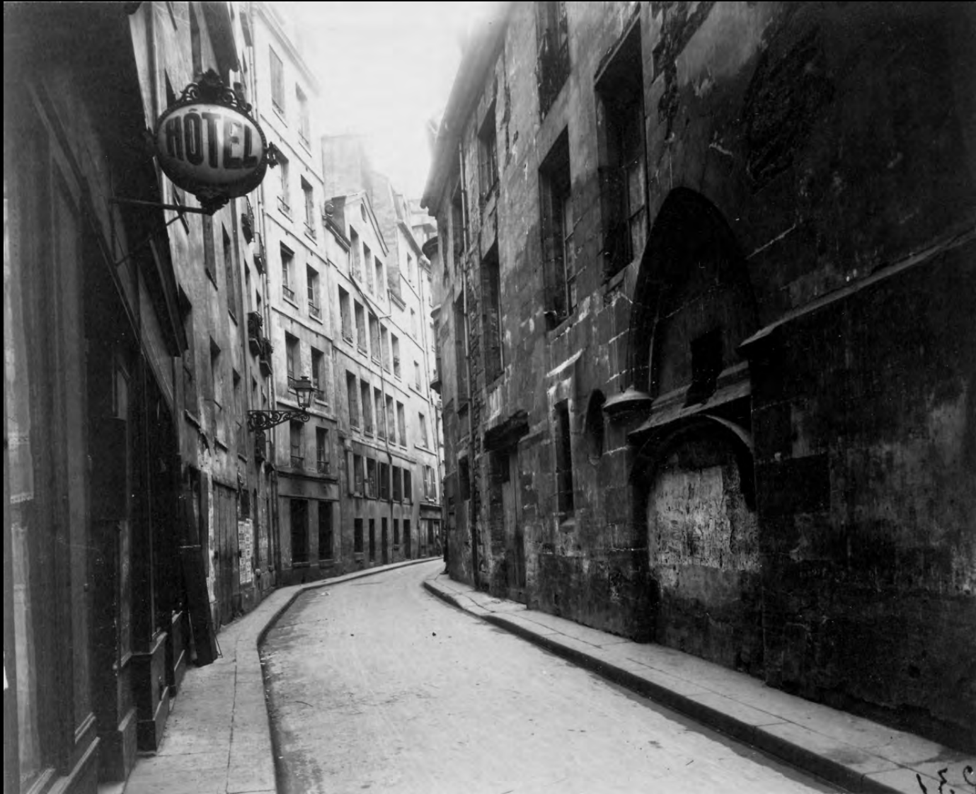
Eugene Atget 1890's Recording and publicizing France