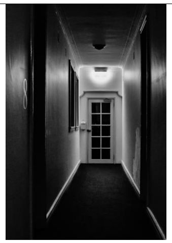
EDPI COMMENDED Behind Closed Doors Renee Sterling