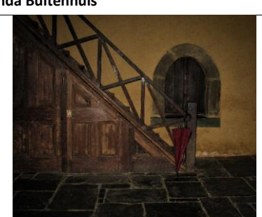
EDPI COMMENDED In from the Rain Phyllis Brereton