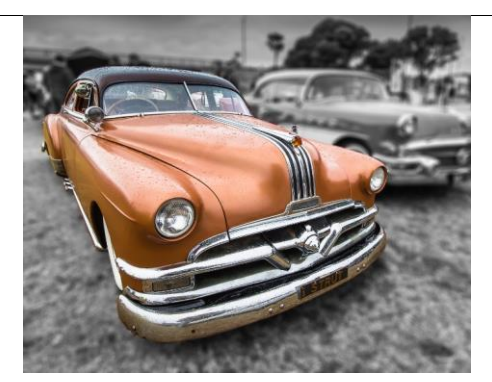
EDPI COMMENDED Pontiac Will Hurst