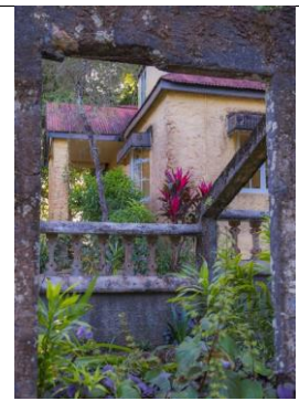
EDPI COMMENDED Through the Window Kathryn Shadbolt