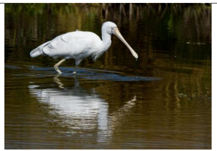
PRINT COMMENDED Spoonbill Jenny Skewes