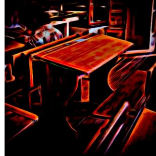
PRINT HIGHLY COMMENDED Abstract School Daze Lynne Cook