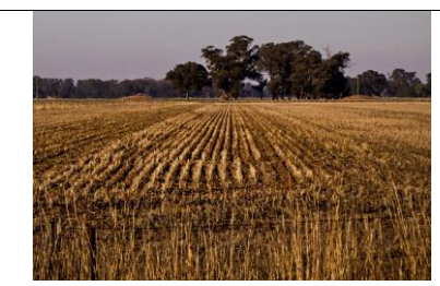
EDPI COMMENDED Harvest is Over Susan Brereton