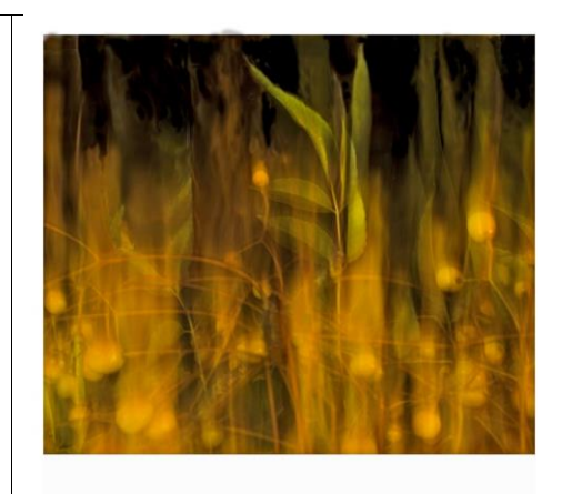
EDPI COMMENDED Different View Colleen Johnston