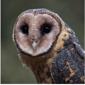
PRINT HIGHLY COMMENDED Bird Portraits Jenny Skewes