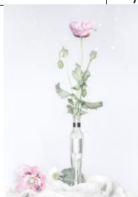
PRINT HIGHLY COMMENDED High Key Still Life Rhonda Buitenhuis