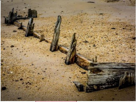
EDPI HIGHLY COMMENDED Queensferry – The Vanishing Town Lynne Cook