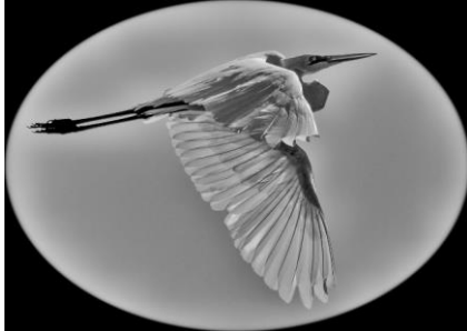
EDPI HIGHLY COMMENDED Birds in Flight Brenda Berry