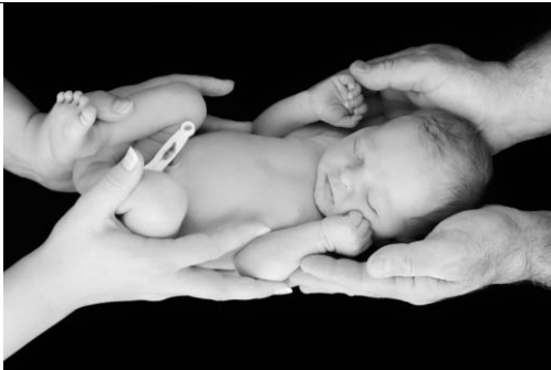
EDPI HIGHLY COMMENDED Black & White and Fifty Shades of Grey Rhonda Buitenhuys