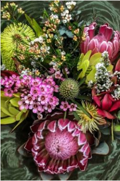
PRINT HIGHLY COMMENDED Flowers Phyllis Brereton