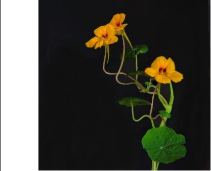
PRINT HIGHLY COMMENDED Yellow Colleen Johnston