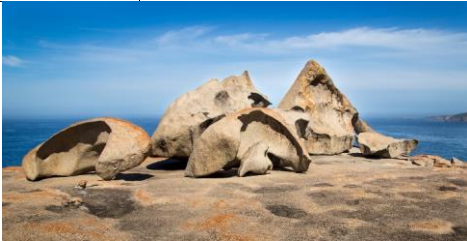
PRINT HIGHLY COMMENDED Quite Remarkable Rhonda Buitenhuis