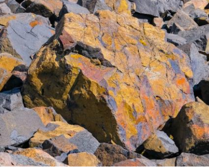
PRINT HIGHLY COMMENDED Coloured Stones Will Hurst