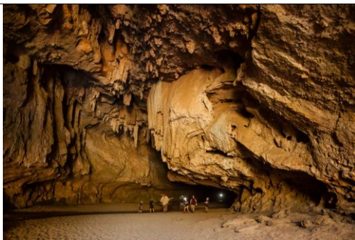
EDPI HIGHLY COMMENDED Tunnel Creek Rhonda Buitenhuis