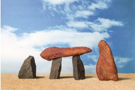
PRINT HIGHLY COMMENDED Newly Found Stonehenge Will Hurst