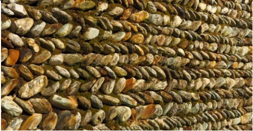
EDPI HIGHLY COMMENDED