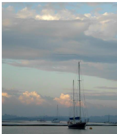
HIGHLY COMMENDED Rhyll David Cook