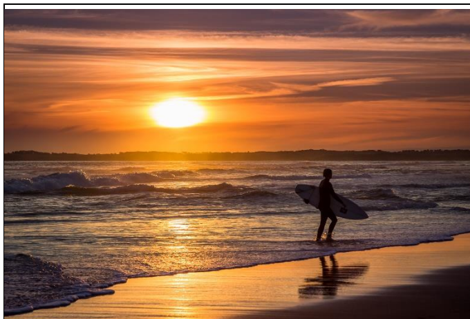
HIGHLY COMMENDED Last Surf of the Day Rhonda Buitenhuis