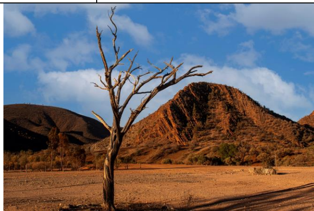
HIGHLY COMMENDED Mount Grisdelda Rob McKay