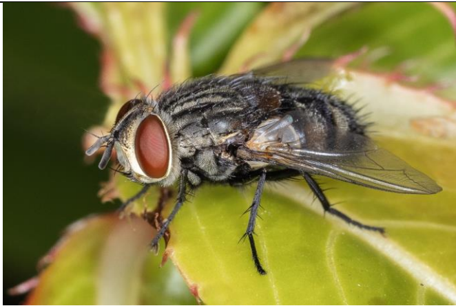
HIGHLY COMMENDED Red-Eyed Flesh Fly Will Hurst