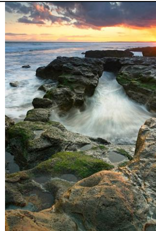
COMMENDED Incoming Sue McLauchlin