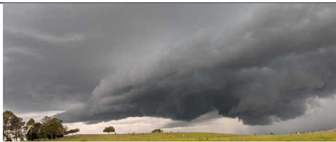
COMMENDED Storm Front Helen Stewart