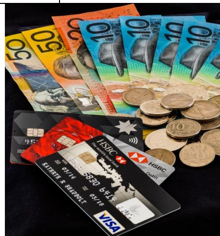
HIGHLY COMMENDED Cash vs Card Kathryn Shadbolt