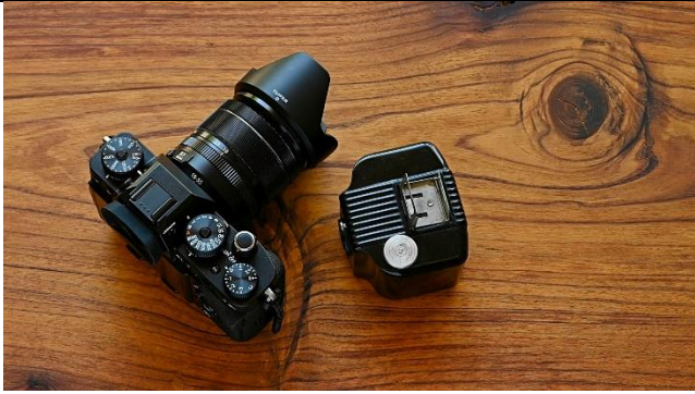
HIGHLY COMMENDED Brownie vs Fuji Sue McLauchlin