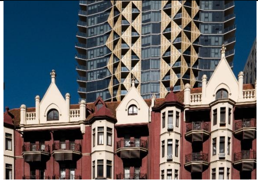
HIGHLY COMMENDED Architectural Contrast Jenny Skewes