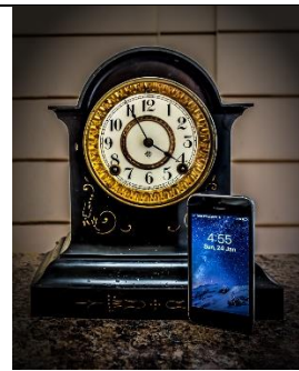
COMMENDED Old vs New 1 Lynne Cook