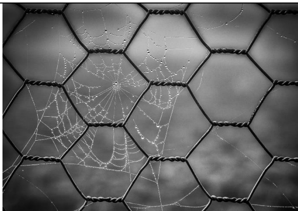
HIGHLY COMMENDED What a Tangled Web We Weave Rhonda Buitenhuis