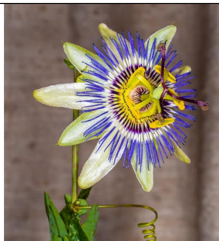
COMMENDED Passionfruit Flower Will Hurst