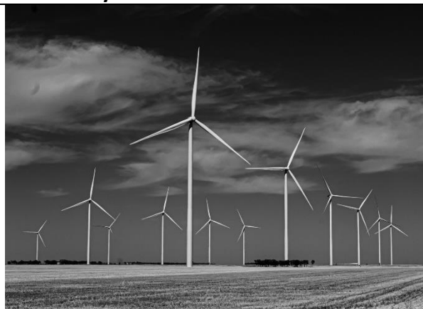
HIGHLY COMMENDED Wimmera's Windmills Jenny Skewes