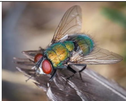
HIGHLY COMMENDED Green Bottle Fly Will Hurst