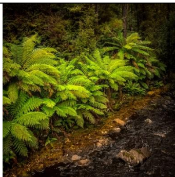
HIGHLY COMMENDED Hidden Creek Sue McLauchlin