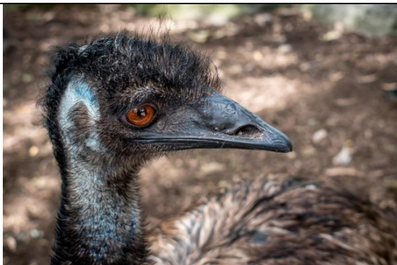
HIGHLY COMMENDED Eye-to-eye Lynne Cook