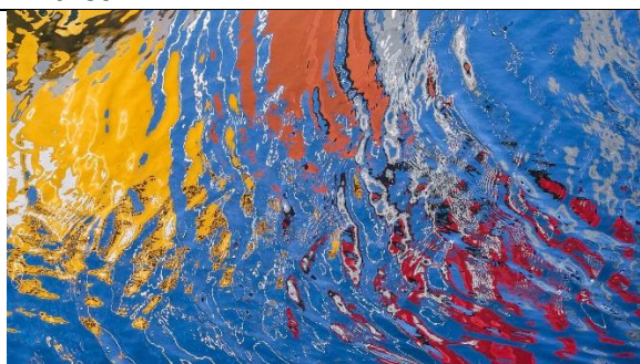
HIGHLY COMMENDED Sea of Colours Will Hurst