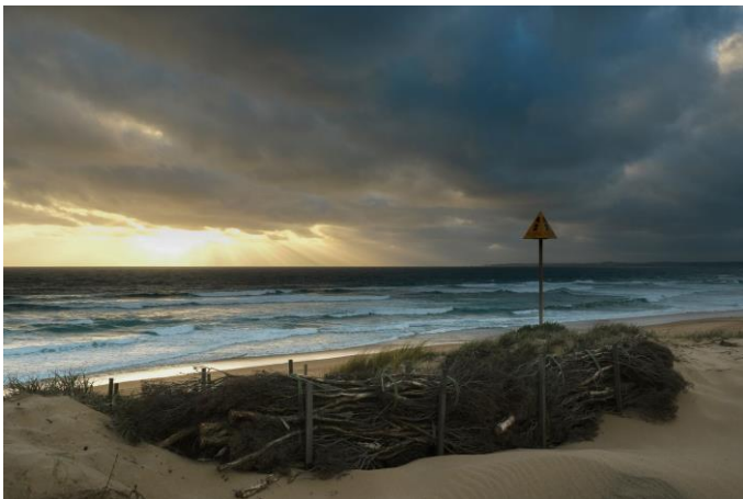
COMMENDED Storm defences Susan McLauchlan