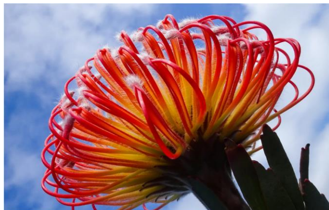
HIGHLY COMMENDED Sky high Joanne Linton