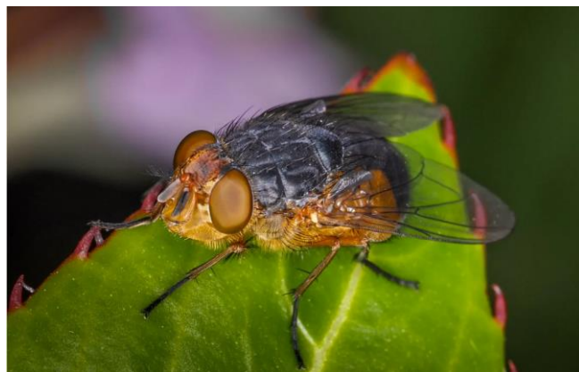
HIGHLY COMMENDED Blowfly Will Hurst