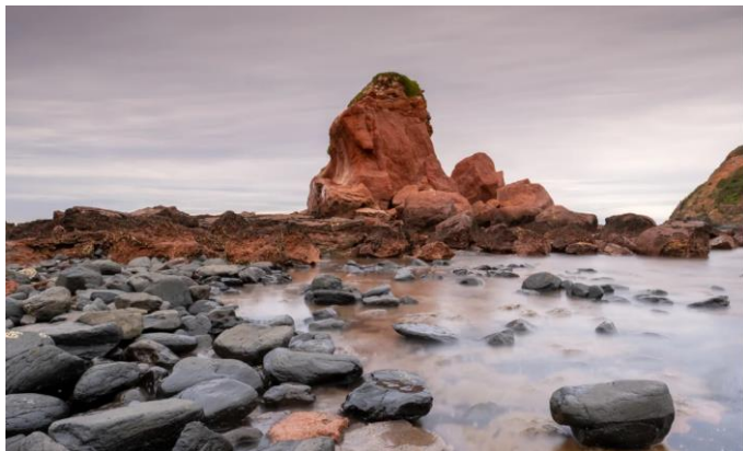
HIGHLY COMMENDED Sunderland Bay Susan McLauchlan