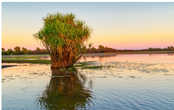
COMMENDED Pandanas in awakening wetlands Kathryn Shadbolt