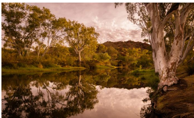
HIGHLY COMMENDED After the rain Rhonda Buitenhuis