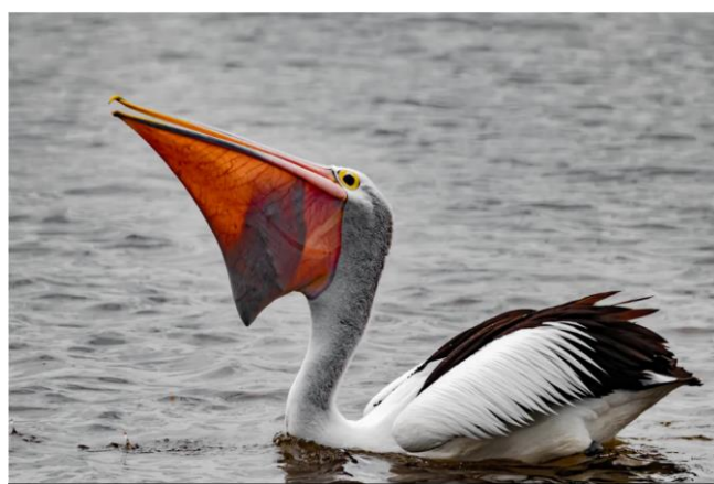
COMMENDED Good catch Brenda Berry