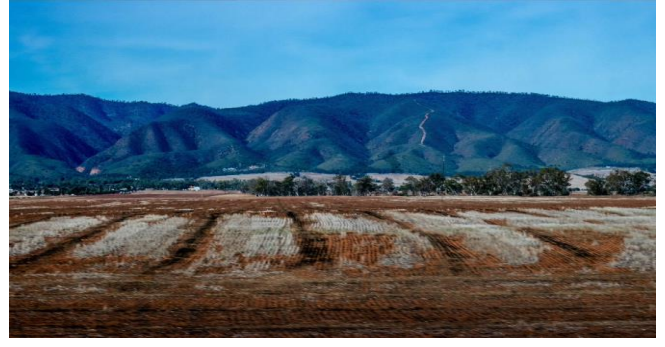
Lynne Cook: Changing scenery COMMENDED