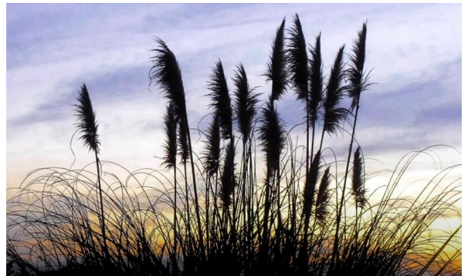
Joanne Linton: Flora HIGHLY COMMENDED