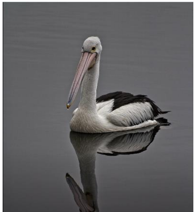
Graeme Lawry: Birds HIGHLY COMMENDED