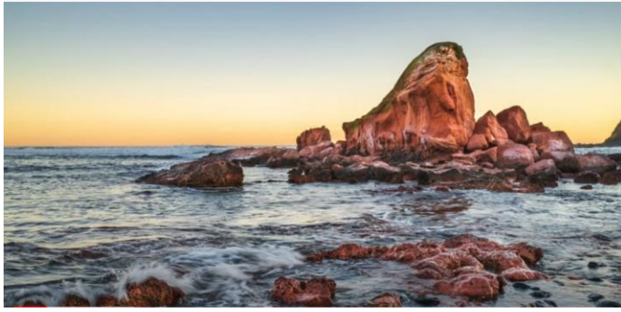
Will Hurst: Seascape HIGHLY COMMENDED