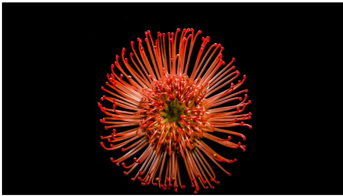
Colleen Johnston: Flowers HIGHLY COMMENDED