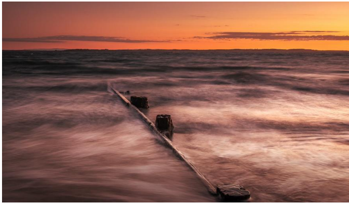
Susan McLauchlan: Coastal long exposure HIGHLY COMMENDED