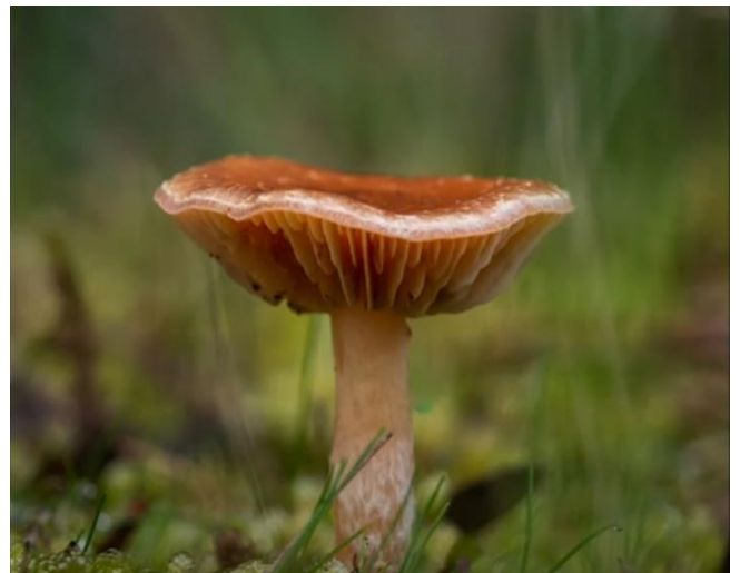
Jenny Skewes: Fungi COMMENDED