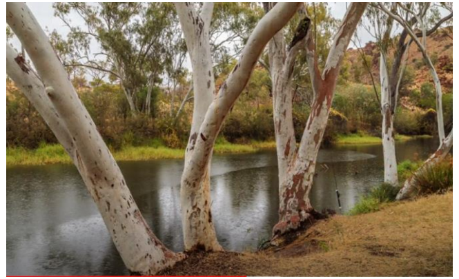
Kathryn Shadbolt: Trees COMMENDED