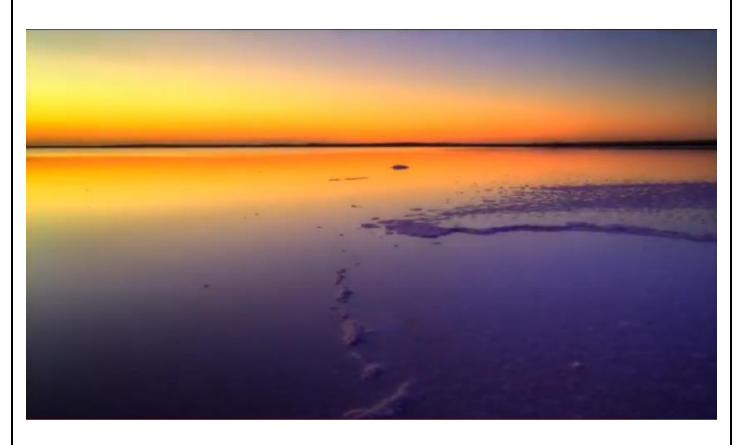
Judith Meier: Salt Lake sunrise Highly commended