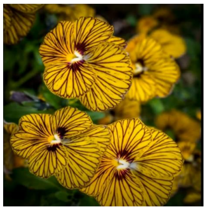
Lynne Cook: Pansies Commended