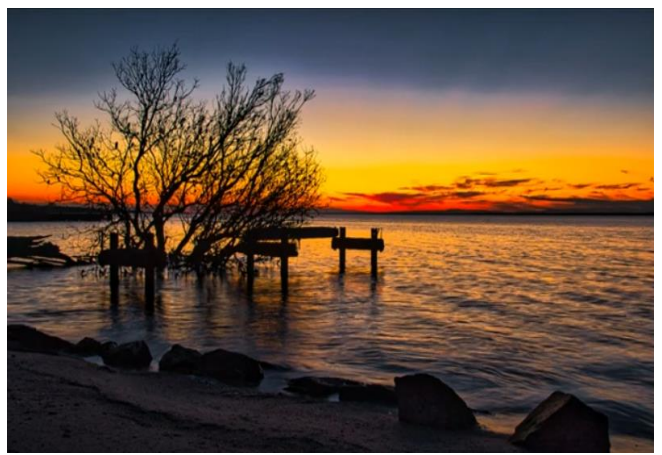
Graeme Lawry: Lochsport Highly commended