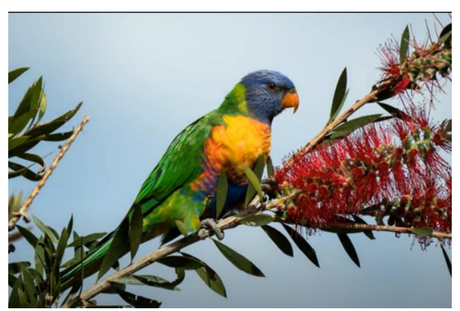
Jenny Skewes: Bottle Brush Rainbow Highly commended