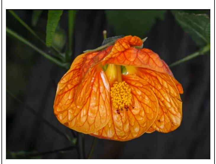
Will Hurst: Chinese Lantern Commended