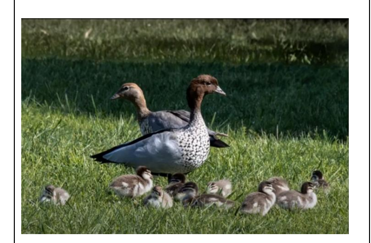
Jenny Skewes: A big family Commended

Some of the images below have been cropped slightly. It is recommended the full-size images are viewed on the slideshow on YouTube.