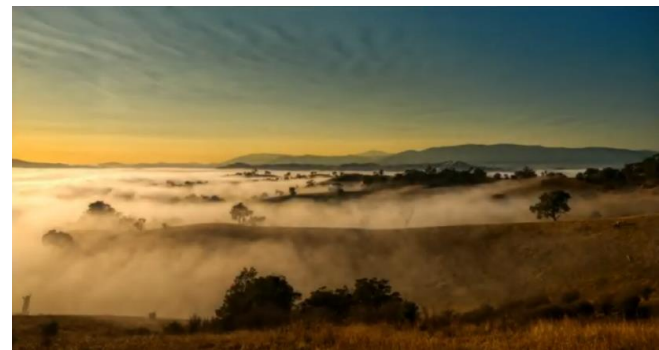
Judith Meier: Misty morning Highly commended