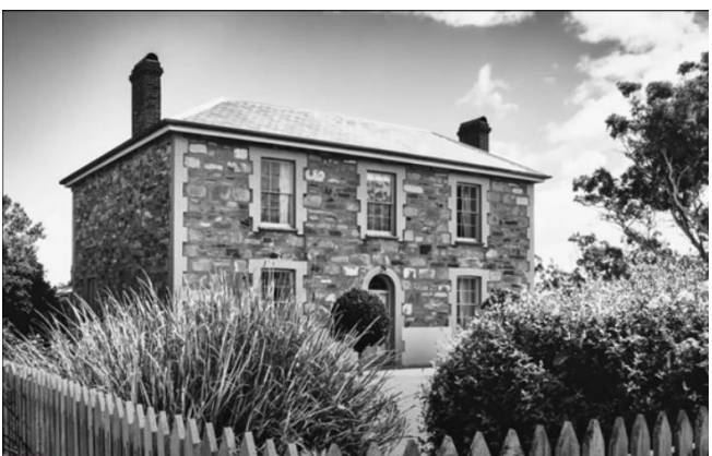
Kathryn Shadbolt: Beautiful old brick house Highly commended