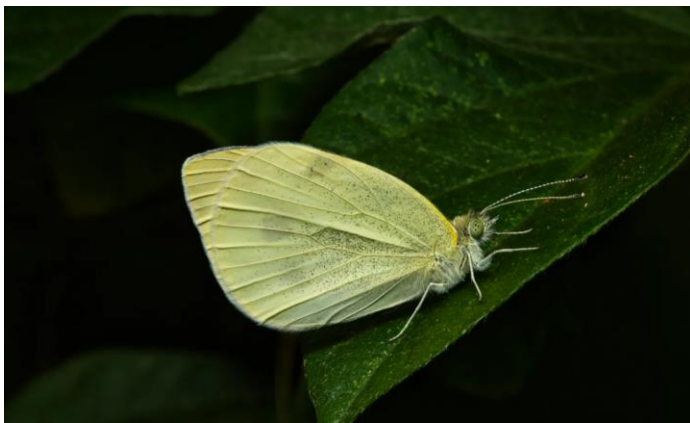
Judith Meier: Butterfly Highly commended