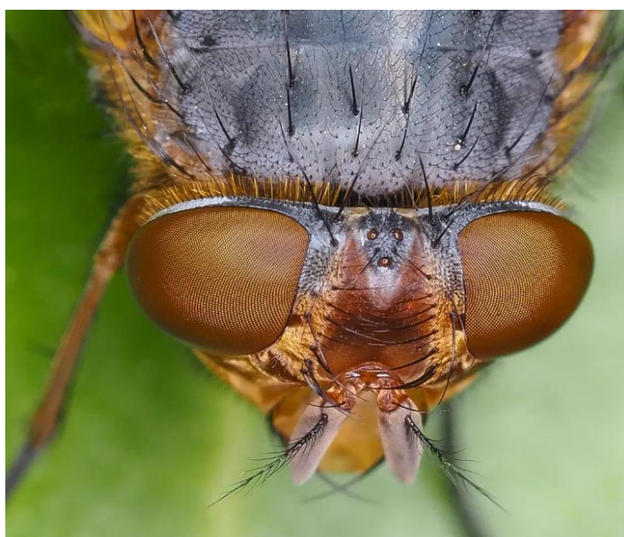
Will Hurst: Closeup blowfly Highly commended

See the following link for the judge's comments