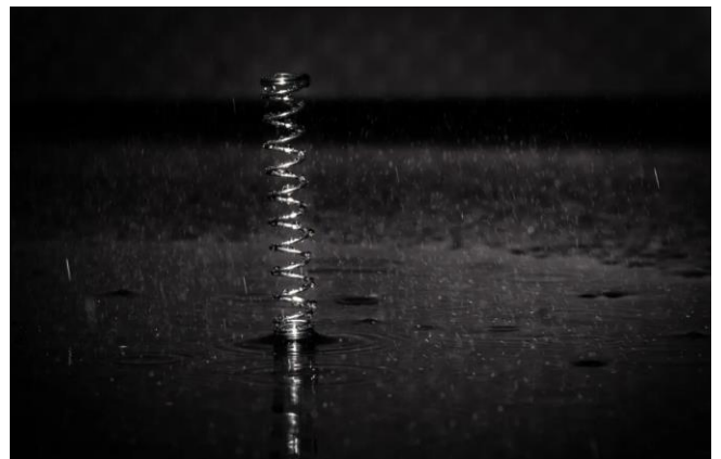
Rhonda Buitenhaus: Spring shower Highly commended