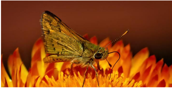
Gary Parnell: The moth Highly commended