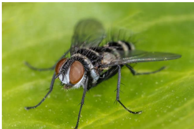
Will Hurst: The stripped fly Commended