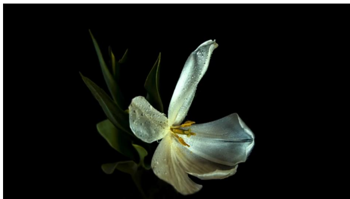
White tulip fading: Colleen Johnston Highly commended folio

A selection of single images from the folios awarded Highly Commended appear below. Note that some of the images are slightly cropped. Viewing of the folio images is recommended on the YouTube slideshow https://www.youtube.com/watch?v=T42t4vZxIRA