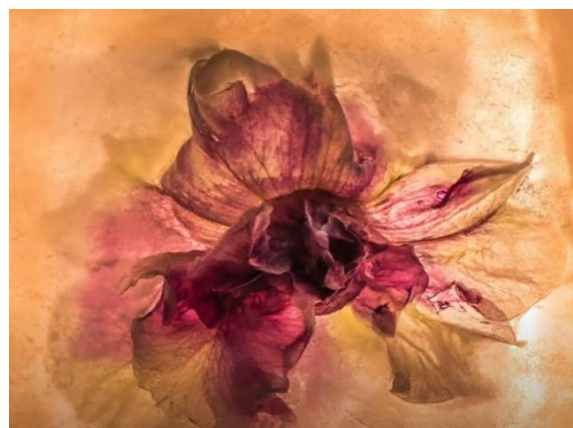
Frozen folio, piece 4: Lynne Cook Highly commended folio