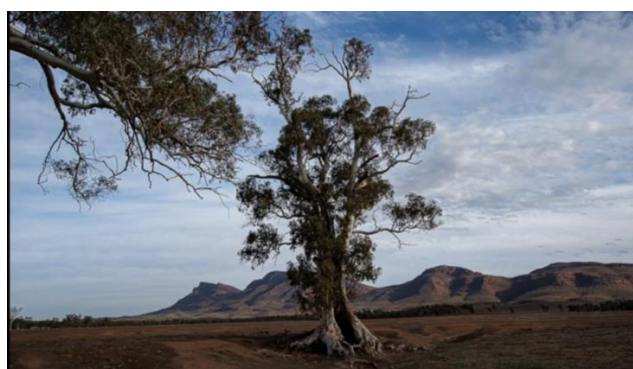
Flinders Ranges folio, piece 1: Rob McKay Highly commended folio