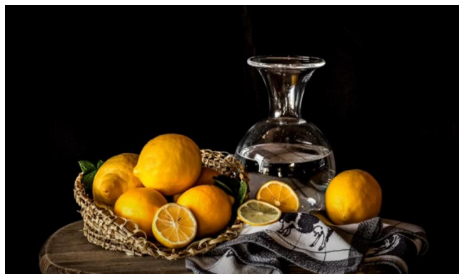
When life brings you lemons, piece 4: Rhonda Buitenhuis Highly Commended folio