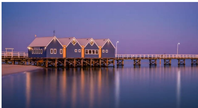
Evening light WA (print folio), piece 2: Susan McLauchlan Highly Commended folio