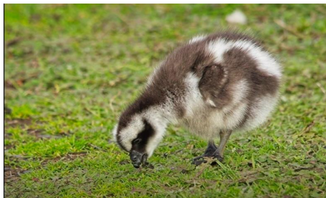
Phillip Island fauna folio, CB gosling: Graeme Lawry Highly commended folio