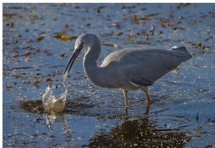
Heron: Graeme Lawry Highly commended