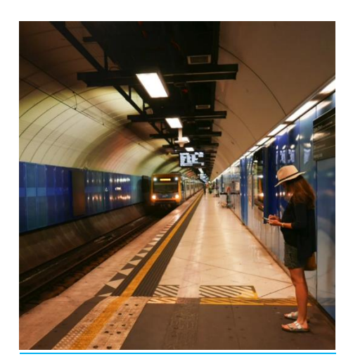
Train coming: Jenny Skewes Highly commended