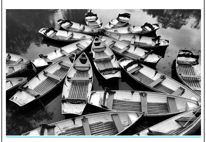
Boats: Jenny Skewes Highly commended