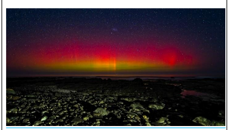
Auroa: Graeme Lawry Commended