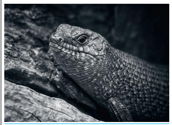
Watchful: Ronda Rhodda Highly commended