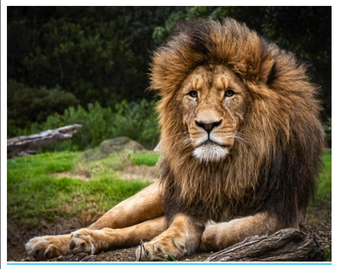
Lion: Ronda Rodda Highly commended