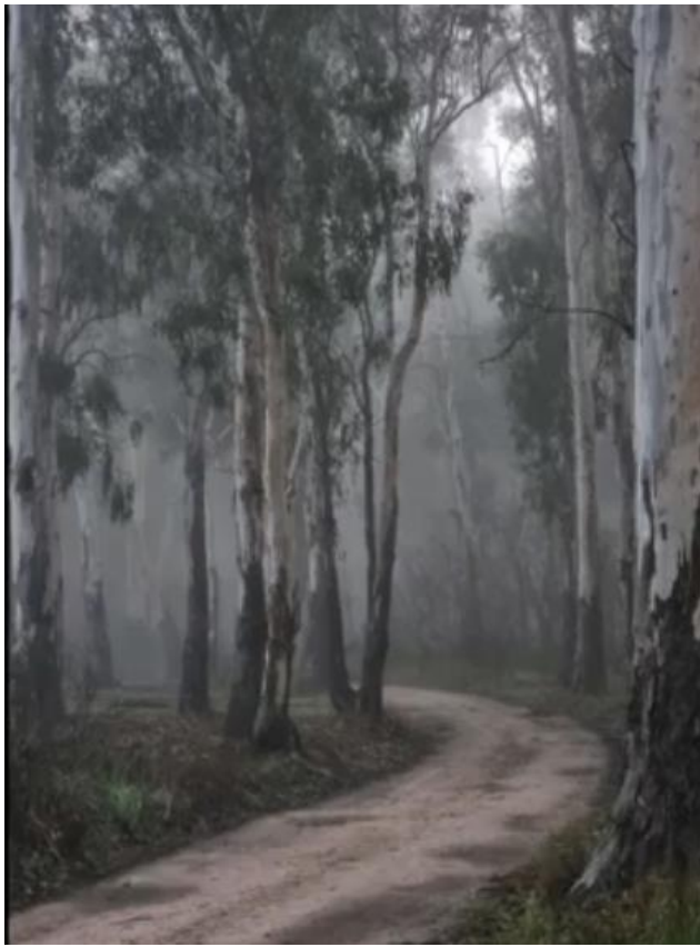
Foggy morning forest walk: Lorraine Tran Highly commended