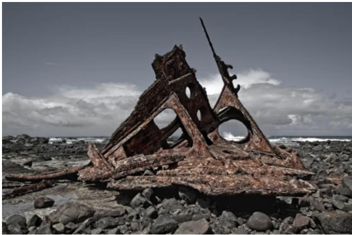
SSSpeke: Graeme Lawry Highly commended