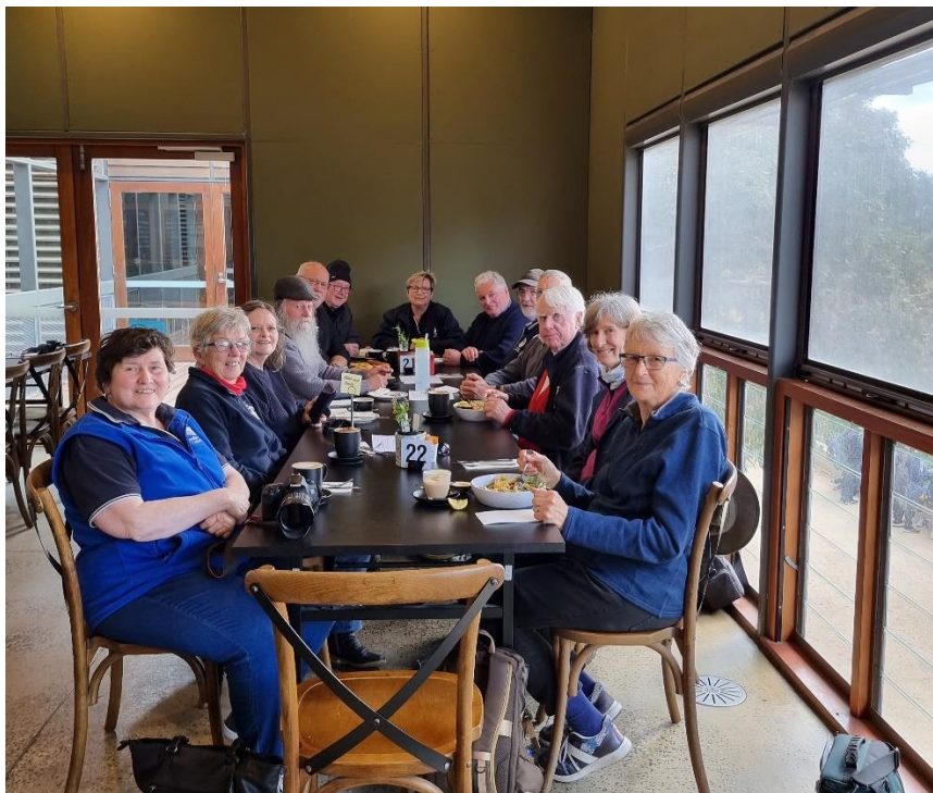
Participants enjoyed lunch at the Cranbourne Botanic Gardens Café.

https://www.youtube.com/watch?v=PFU9-whiFuw