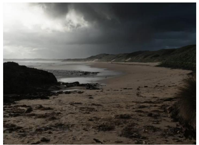
Wintry beach: Jenny Skewes Highly commended