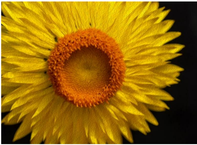
Yellow: Ronda Rodda Highly commended