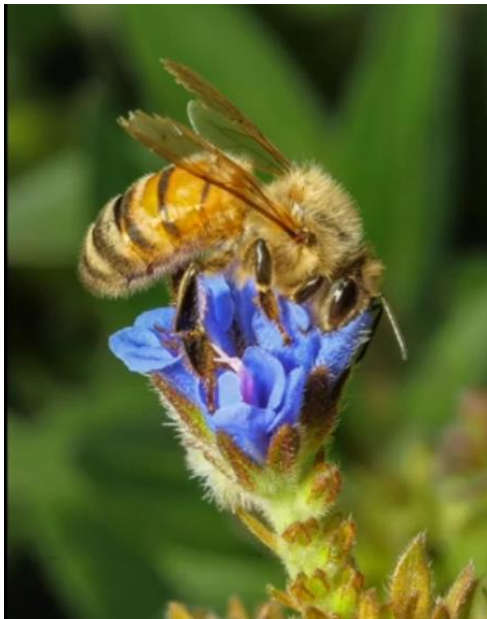
Nose first (Print): Will Hurst Commended