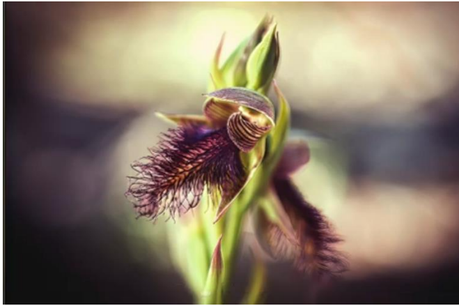
Bearded orchid: Rob McKay Highly commended