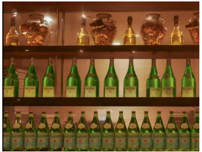
Bottles: Jenny Skewes Commended