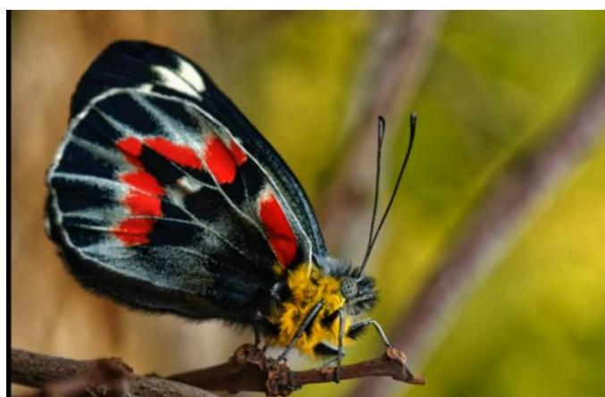
Butterfly: Judith Meier Highly commended