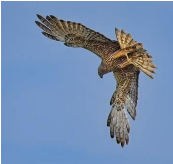
Swamp Harrier (Print): Graeme Lawry Commended