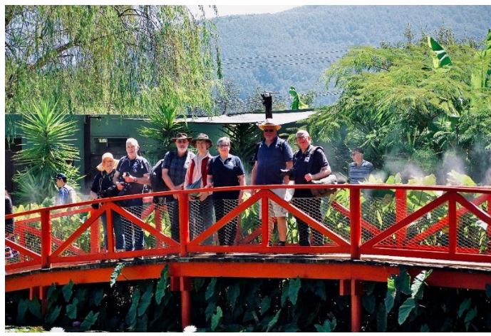
PICC members enjoying the views and cooling off in the spray mist at the Blue Lotus Water Gardens in Yarra Junction. Image supplied.