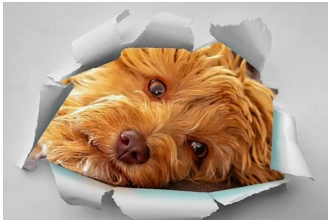
Torn: Gary Parnell Highly commended