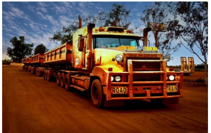
Road Train: Rob McKay Highly commended