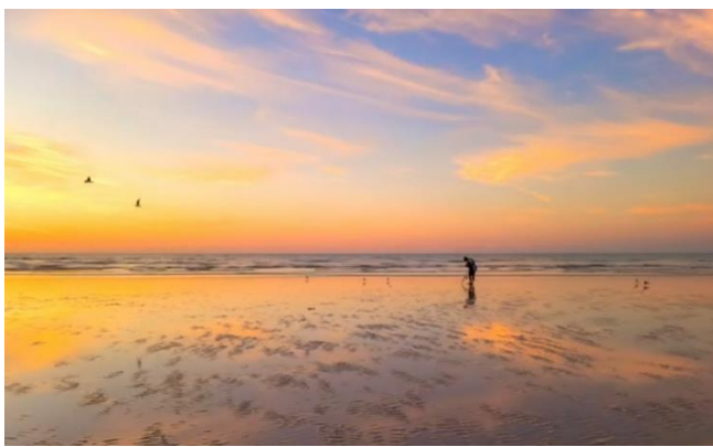
Sunset at 80 Mile Beach: Rhonda Buitenhaus Highly commended