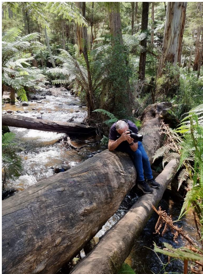
David went out on a limb to capture an image of Cement Creek at the forest.