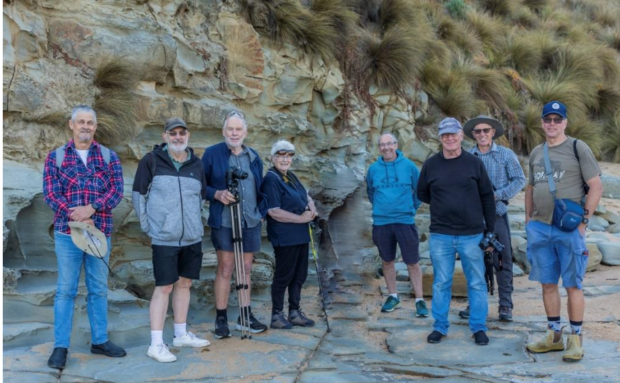
Participants at the Cadillac Canyon excursion.

The Bore Beach/Cadillac Canyon excursion was held on 12 th February and attended by nine participants. It provided a great opportunity for attendees to capture crashing waves and rocks – perfect for our monthly challenge – Seascapes.