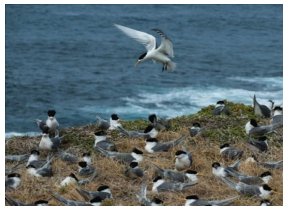
Terns: Jenny Skewes Highly Commended