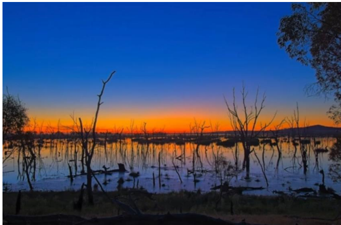
Winton Wetlands: Graeme Lawry Highly commended