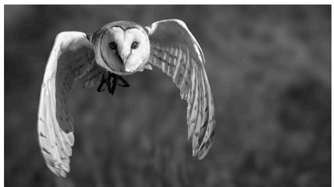
Gary Parnell- 'Barn Owl In Flight' - C