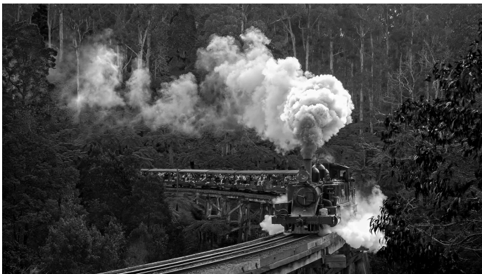
Gary Parnell - 'Puffing Billy' - HC