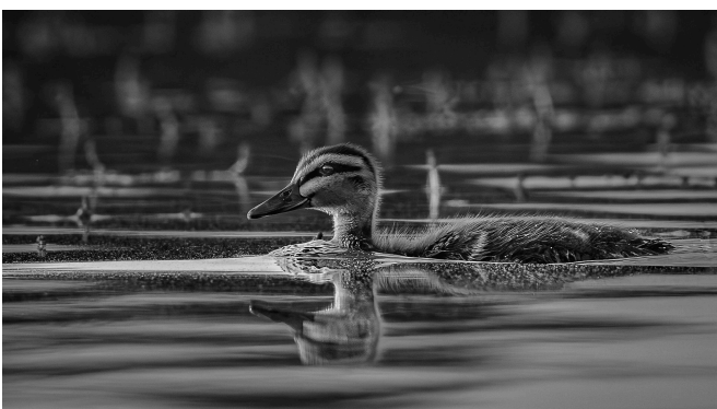
Graeme Lawry - 'Just Paddling' - C