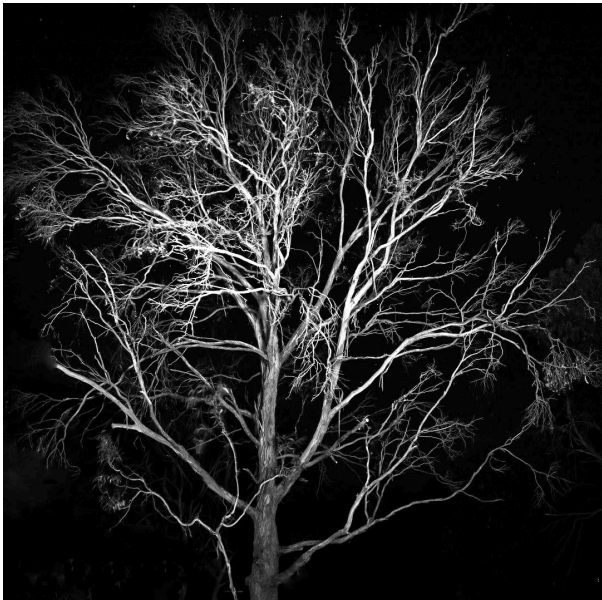
Kim Poole - 'Night Tree' - C