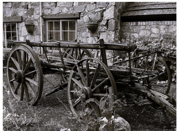
Karen Cashen - 'Vintage Wagon' - C