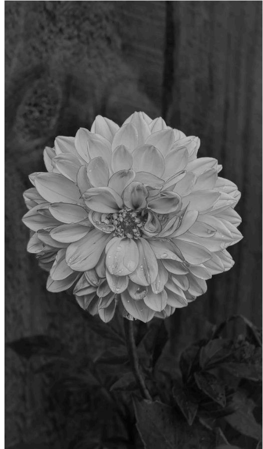
Caroline Franklin - 'In Bloom' - C